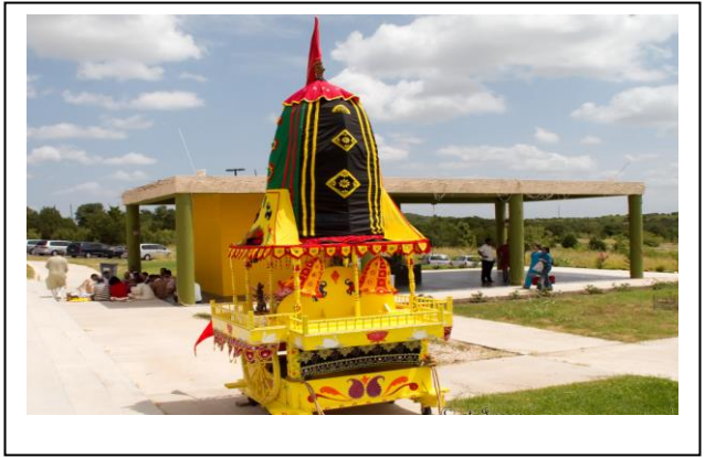
Ganesh Temple in 2007