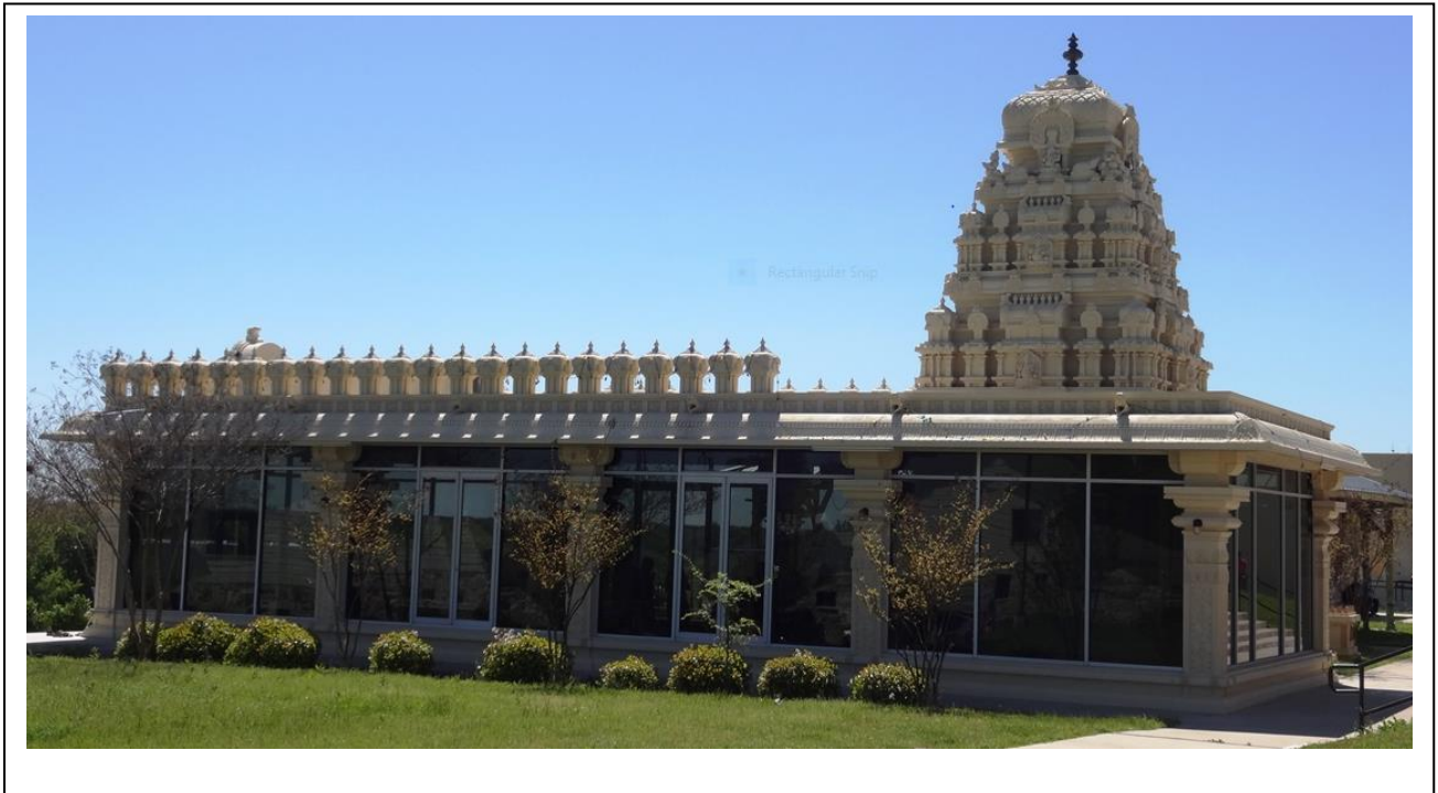
Sri Vara Siddhi Vinayak Temple as it stands today.